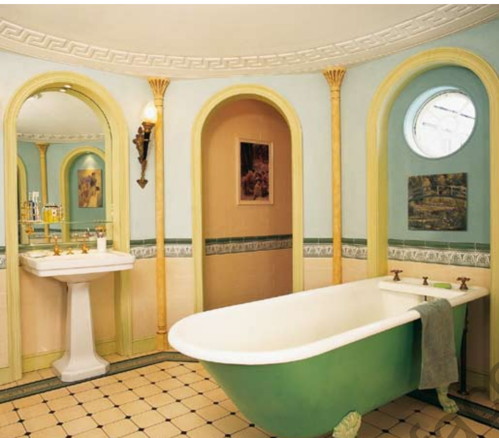
Tiles used in this setting: 6362 Monet: Waterlily Pond with 6367B Colonial White frame, 6361 Alma-Tadema A Coign of Vantage and 6359 Baths of Caracalla with 6366B Colonial White frame, B9002 Colonial White Half tile, GJB9022A Jade Breeze Parthenon, GJB9909 Jade Breeze Omega, GJB9900 Jade Breeze Albert. For flooring see Original Style Victorian Floor Tiles brochure.