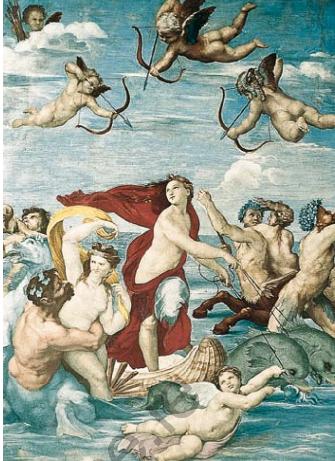
6365B Raphael: Galatea (1511-12), Villa Farnesina, Rome.

Galatea (1511-12) is a fresco commissioned by the Sienese banker, Agostino Chigi, to decorate the wall of a loggia at his riverside villa. It shows the nymph, Galatea, dramatically surrounded by "amorini, mermaids, hippocamps and nereids" and survives today in what is now called the Villa Farnesina, after a later owner.