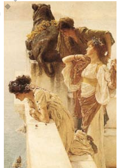
6361 Alma-Tadema: A Coign of Vantage (1895), private collection.