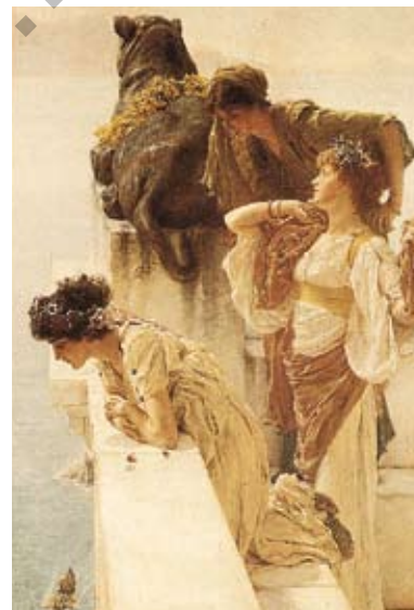
6361 Alma-Tadema: A Coign of Vantage (1895), private collection.