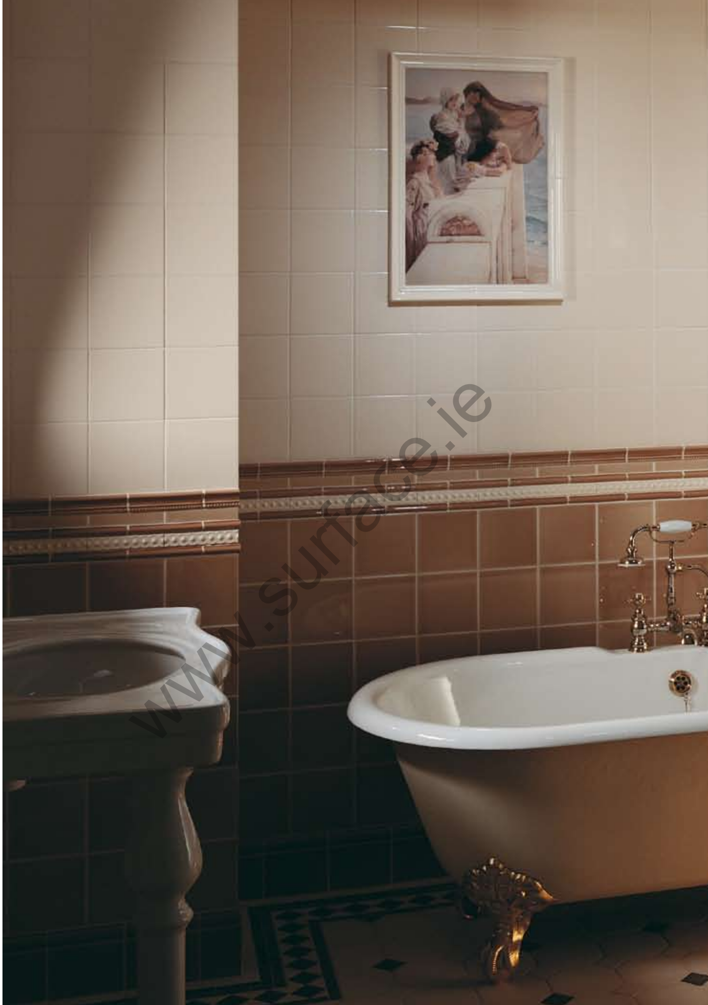
Tiles used in this setting: 6358 At Aphrodite's Cradle, 6361 A Coign of Vantage, 6359 The Baths of Caracalla, GJT9903 Skirting, GJT9900 Albert, GJT9928 Hogarth (all Sepia), GIC9000 Field tiles, GIC9909 Omega, GIC9221 Rectangle (all Ecru), B9000 Field tile, B9002 Half Field tile, B9921 Sigma, B9923 Scroll, 6366B Frame set (all Colonial White). For flooring and panel centre tile see Original Style Victorian Floor Tiles brochure.