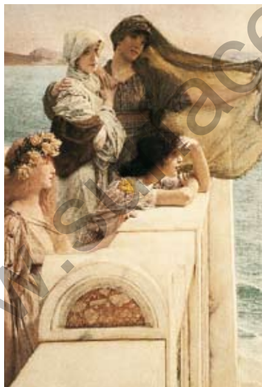
6358 Alma-Tadema: At Aphrodite's Cradle (1908), private collection.

Matching Frame Sets also available: 6366A Brilliant White. 6366B Colonial White. 6366N Black.