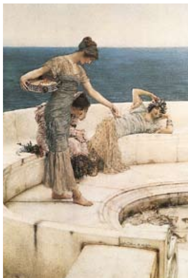
6360 Alma-Tadema: Silver Favourites (1903), Manchester City Art Gallery.