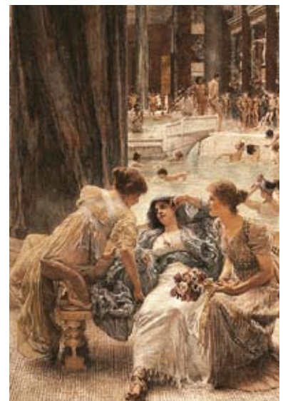
6359 Alma-Tadema: The Baths of Caracalla (1899), private collection.