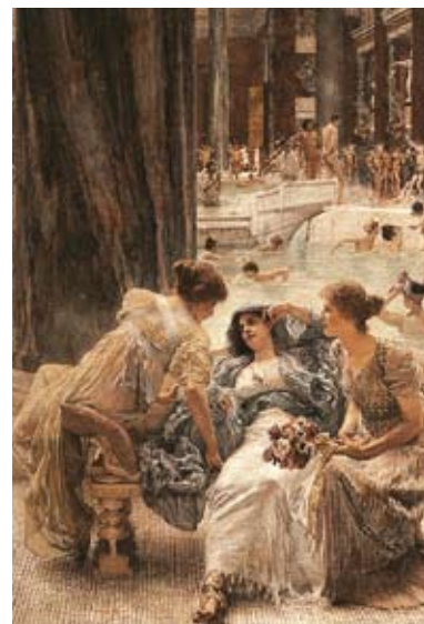
6359 Alma-Tadema: The Baths of Caracalla (1899), private collection.